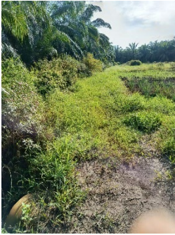
17/07/2025 – Baseline (After Applications)