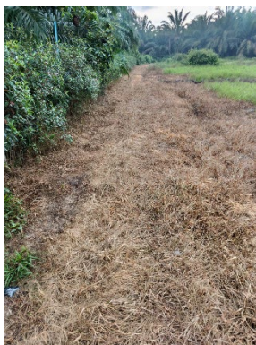
Plot 1 – 100% glyphosate