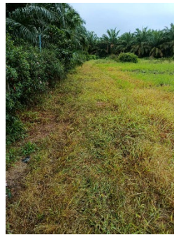
22/07/2025 – Day 6 (Early effects observed)