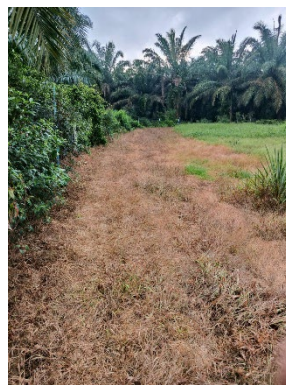
Plot 2 – 50% glyphosate