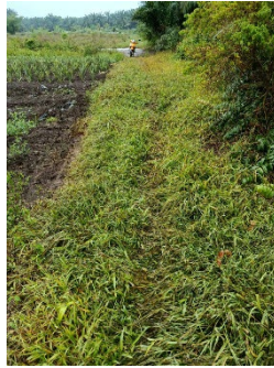
22/07/2025 – Day 6 (Early effects observed)