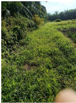
17/07/2025 – Baseline (After Applications)