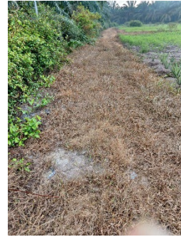
07/08/2025 – Day 22 (Final assessment)