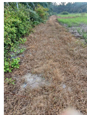
Plot 3 – 50% glyphosate + Saver +