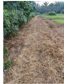
07/08/2025 – Day 22 (Final assessment)